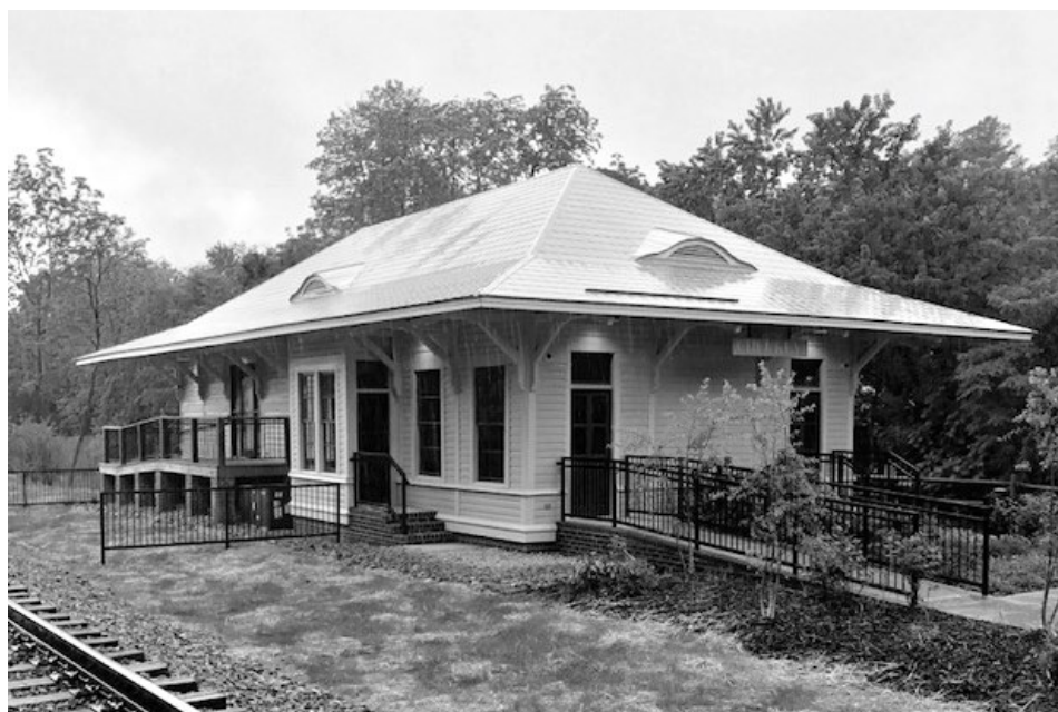
Chucky Depot in its new Jonesborough home

our other tours, it will head west to the depot. After Jonesborough Days, our railroad tour will happen on the first Friday of every month at 1 pm. During Jonesborough Days, we will feature all of our tours at different times through the weekend. Be sure to check your Jonesborough Days program for tour times and topics!