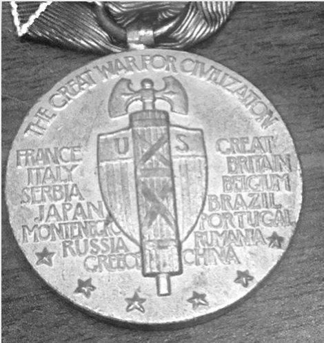
World War I decorative medal from the Museum's collection

To honor this year's centennial of the United States' entry into World War I, an exhibit of military artifacts are on display at the Jonesborough & Washington County History Museum. The exhibit will debut over Memorial Day Weekend.