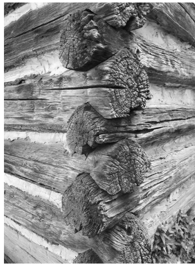
V-notched wall logs.

numerous needed repairs. The Heritage Alliance is seeking additional funding to assist with the completion of these repairs. Once key projects have been completed, a cyclical maintenance program, administered by the Heritage Alliance in cooperation with the Town of Jonesborough, will ensure a long future for this irreplaceable historic resource. Funding for this project was made possible through the State of Franklin Chapter, National Daughters of the American Revolution.