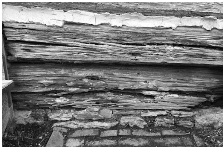
Deteriorated sill log in need of repair.