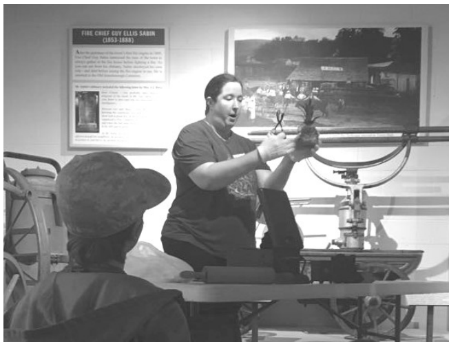
Learning about artifacts at the Jonesborough/ Washington County History Museum

The second Homeschool Day is planned for August 10. Registration will begin in mid-June, keep an eye on www.heritageall.org for more details. A lot of the activities fill up quickly!