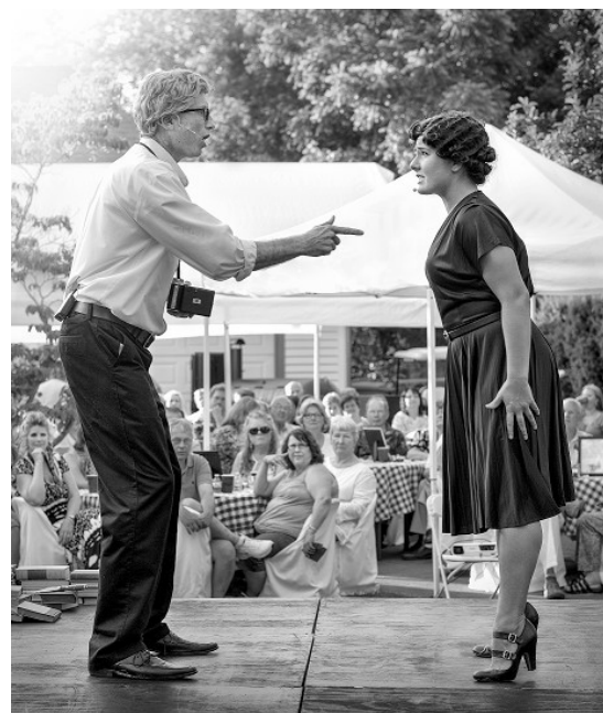
A scene from "With These Hands"

The play brings stories of Jonesborough's past to life... Can two families on opposing sides of the Civil War share the same house? Can a former Southern belle accept help from a Freedman? How did the railroad impact the lives of local people, and what exactly is "historic" spit? Tickets are available now at 423.753.1010.