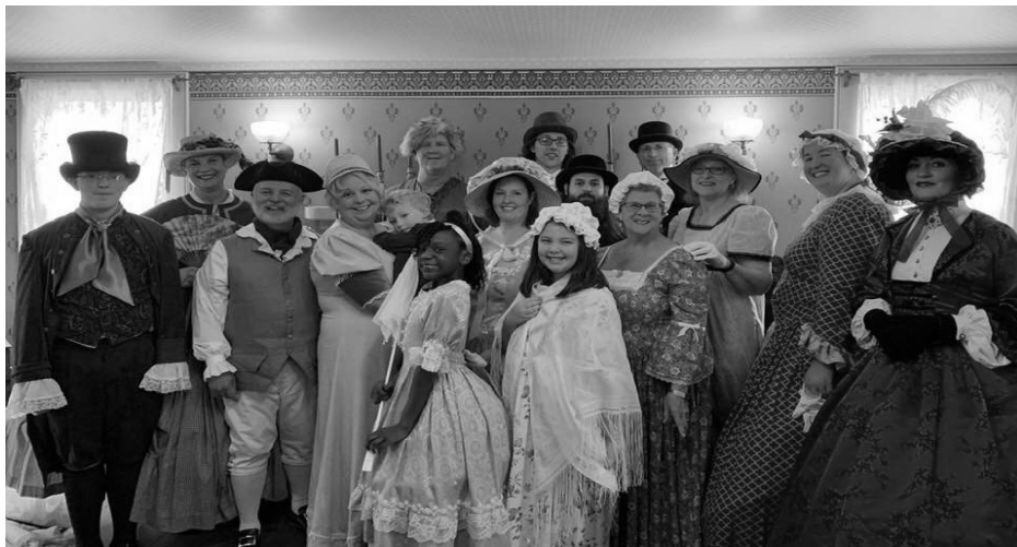
The collection of volunteers who participated in the show and the period costumes which range from frontier through the early 1900s.

As a show of appreciation, the Heritage Alliance organized a fashion show. The models volunteered their time to