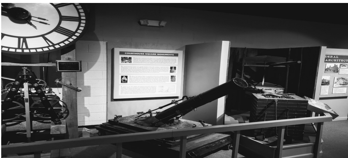
The WWI mortar is now located beside the courthouse clock.

We have a lot going on at the Jonesborough-Washington County Museum right now. In addition to the digitization project, we are working on some fairly large changes in the museum itself. Recent visitors may have noticed that the WWI mortar has been relocated beside the courthouse clock. This move