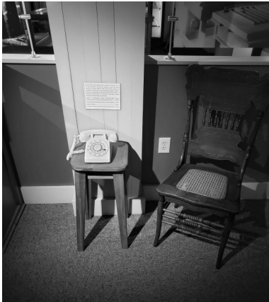
Interactive 20th c. Rotary Phone