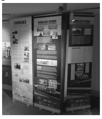
"Black in Appalachia: African American History in Kingsport" is on display through July 5th

price, but there is a suggested $2 donation per visitor. We recommend that visitors wear face coverings while visiting the museum and can provide one for a $1 donation. Keep up to date with the museum by following the Chester Inn on Facebook, Instagram, and YouTube!