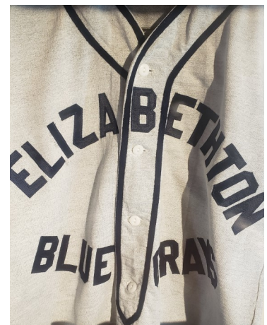
Above: Elizabethton Blue Grays Uniform on Display

This is the first part of an exhibit collaboration between the Chester Inn and Cedar Grove, with the second exhibit coming in March of 2022. The current exhibit will be on display through October.