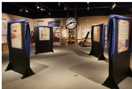
Above: Circus Exhibit on Display

the highs and lows of America's "greatest show," and the impact that it had on our region and its inhabitants.