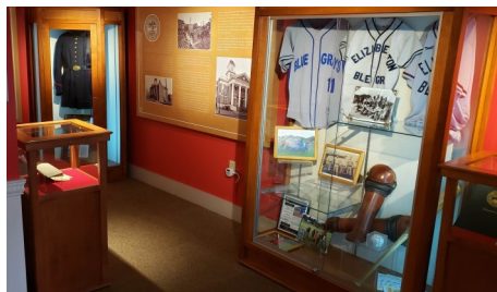
Left: The Cedar Grove Exhibit